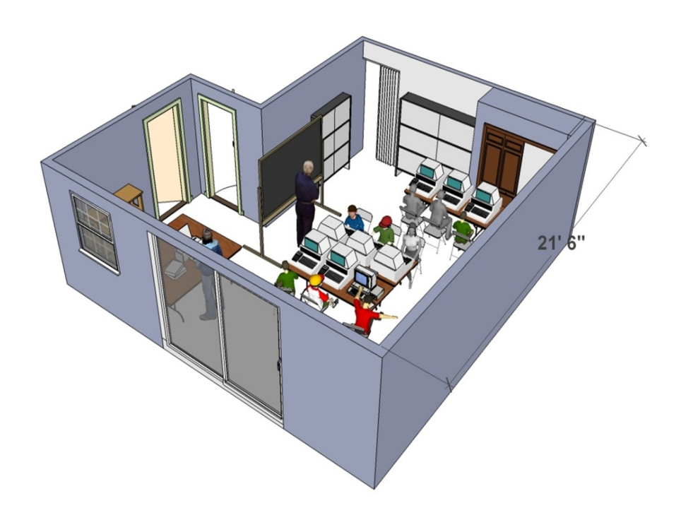
Figure 1: Computer classroom in the Friedman home.